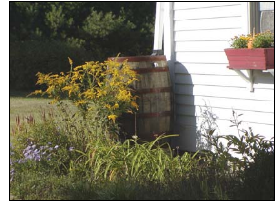
Rain barrels collect and store water from rooftop runoff for later use.